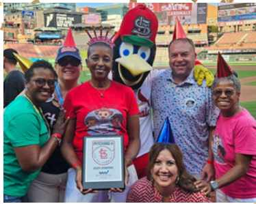
St. Louis Cardinals Pitching in the Community Award (IYBI)

$15 Gift Cards donated during the We ♥ Gift Cards Drive, donating a total of nearly $1,000