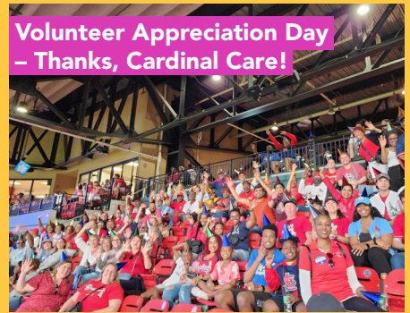
Volunteer Appreciation Day – Thanks, Cardinal Care!