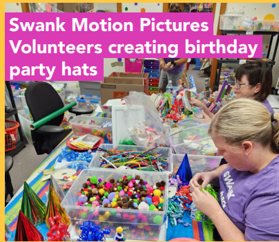
Swank Motion Pictures Volunteers creating birthday party hats