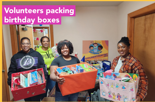
Volunteers packing birthday boxes