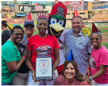
St. Louis Cardinals Pitching in the Community Award (IYBI)